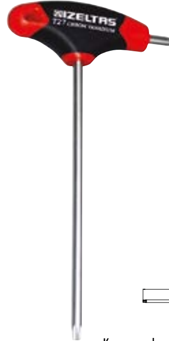
Krom vanadyum, Krom kaplı, PP saplı Chrom vanadium, Chrom plated, PP handle

T Tipi Torx Allen Anahtar T Handle Torx Key Wrench